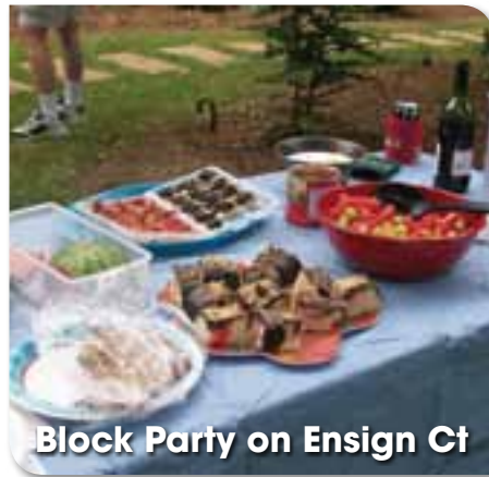
Block Party on Ensign Ct