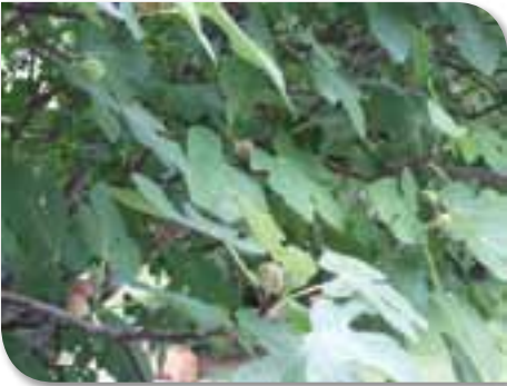
Fig Tree on Montford