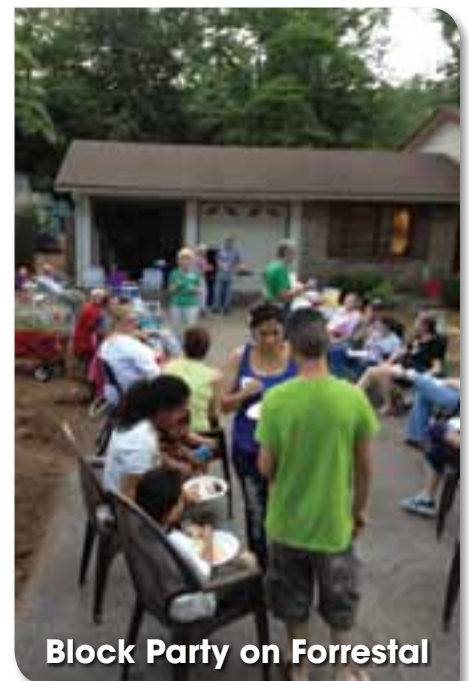
Block Party on Forrestal