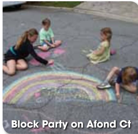
Block Party on Afond Ct