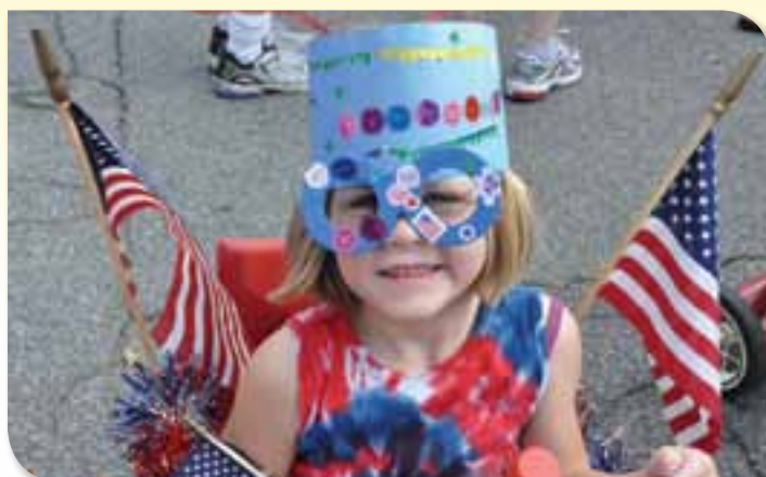
Celebrating July 4th in HH

The summer was filled with fun events in Huntley Hills. The Neighborhood Watch program sponsored block parties throughout the neighborhood in May and June. Each Block Captain coordinated the party for their area. Families got together to socialize, meet new neighbors and enjoy hot dogs, hamburgers, BBQ and ice cream. Next was our annual Huntley Hills July 4th parade. Over 100 kids of all ages were out in their red, white and blue – riding bikes and scooters, walking and pushing little ones in strollers. The Chamblee police led the parade with two policemen on motorcycles. Awards were given for the best decorations and everyone cooled off with popsicles at the end.