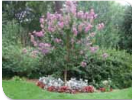
Crepe Myrtle and Flowers on Longview