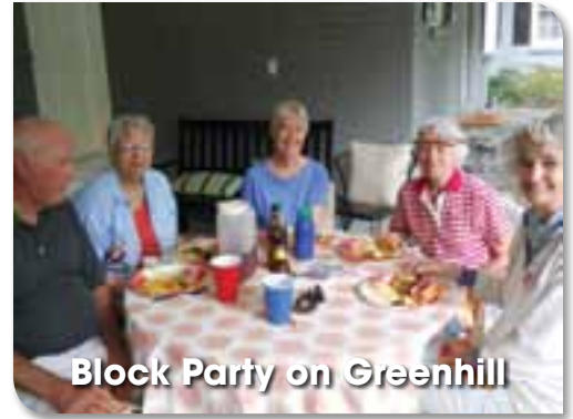
Block Party on Greenhill

In May and early June, many of our neighborhood watch Block Captains organized get-togethers for their neighbors. In some cases, several block captains joined together to host a party. Thanks to all of the block captains that hosted parties. See the pictures below. The neighborhood association plans to make this an annual event and we hope to see the participation increase next year. So if you missed out on this year's event, we hope that you will try to participate with us next year!