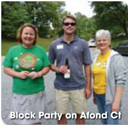
Block Party on Afond Ct