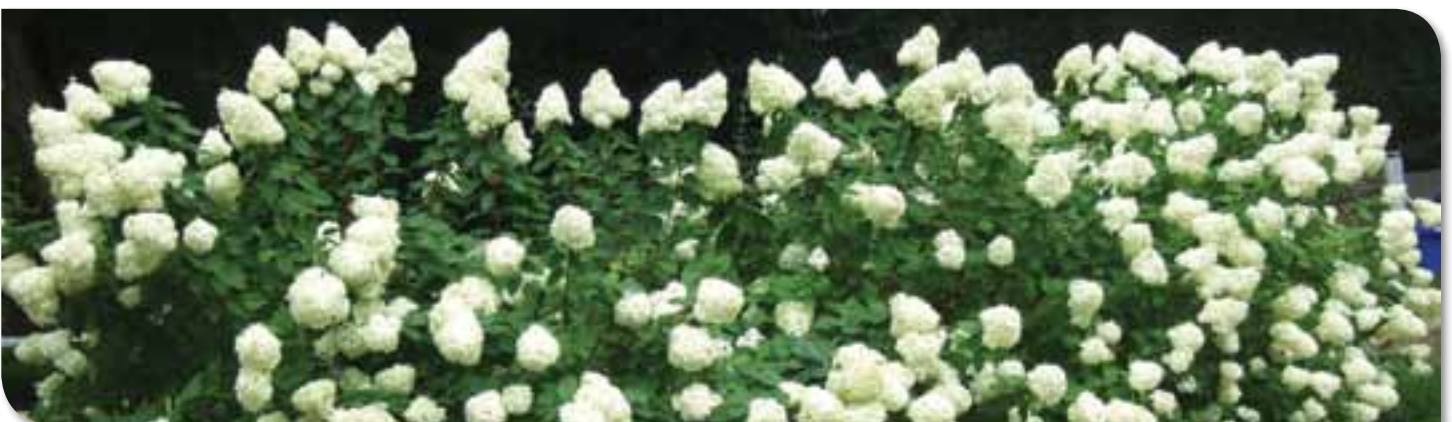
Limelight Hydrangeas on Greenhill –WOW!