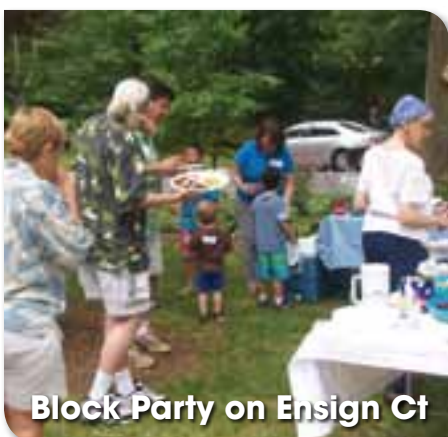
Block Party on Ensign Ct