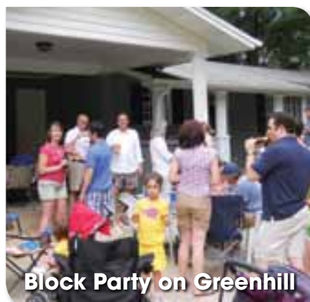
Block Party on Greenhill