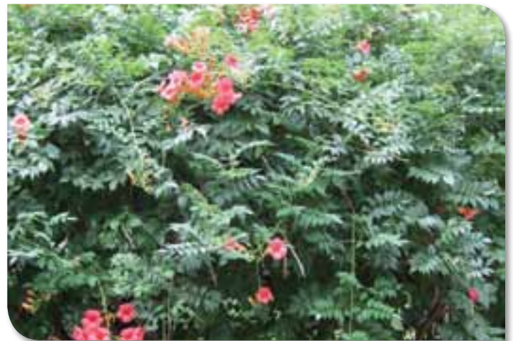
Trumpet Vine on Captain