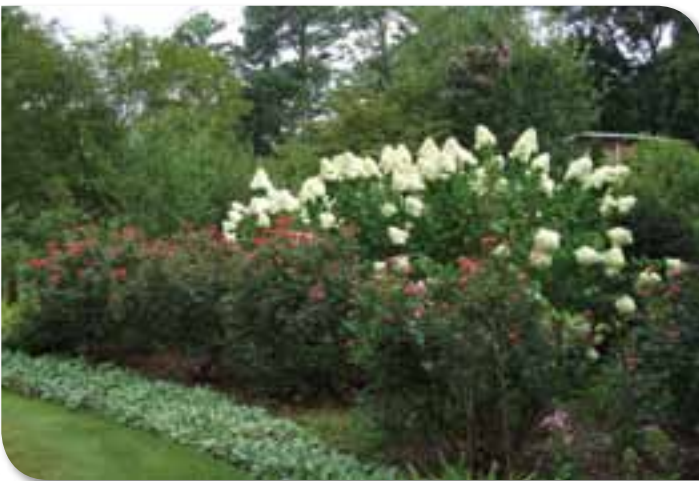
Knockout Roses and Limelight Hydrangeas on Longview and Commander