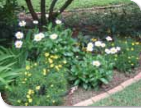
Becky Daisies on Seaman Circle – white flower with yellow center