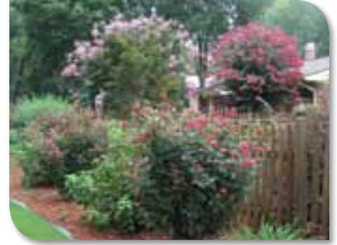
Knock-out Roses and Crepe Myrtles on Admiral