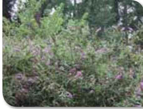
Butterfly Bush in the Butterfly Garden at the Park