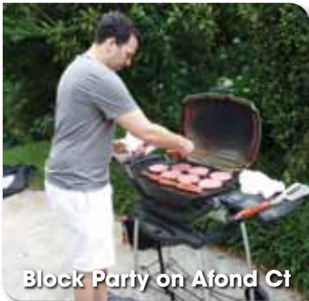
Block Party on Afond Ct