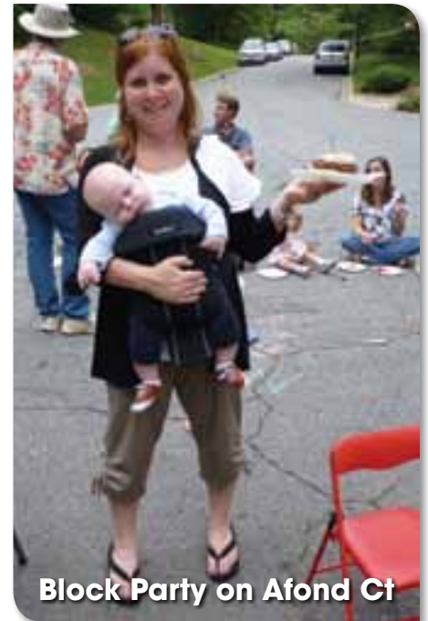
Block Party on Afond Ct