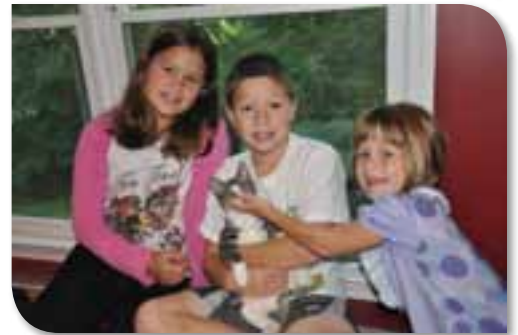
August 2012 - look how big Addy has grown!