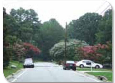
Crepe Myrtles on Admiral