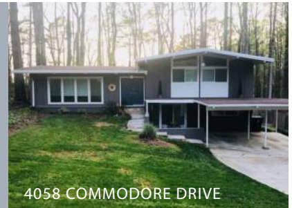
4058 COMMODORE DRIVE

*Exclusively listed and sold by Bolling Hines Keller Williams® Peachtree Road